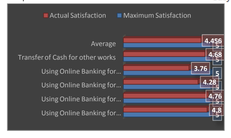
Figure3: UserSafetyofElectronic bankingduringCovid-19 VirusPandemic

ISSN: 2320-3714 Volume: 2 Issue: 3 June 2021 Impact Factor: 6.7 Subject: Economics