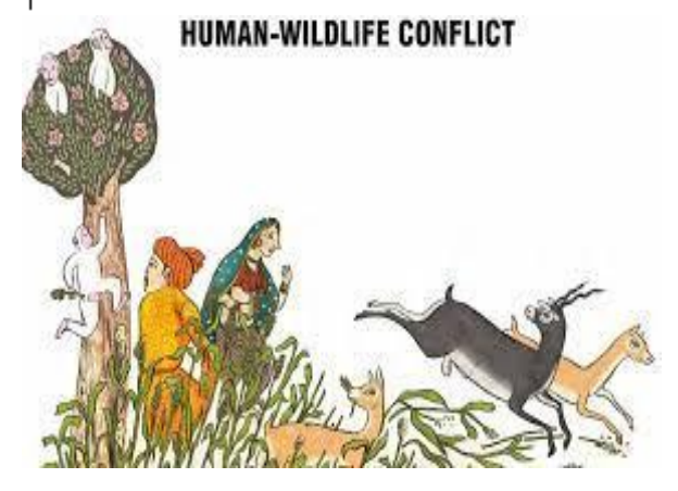
Figure 1: Human -wildlife conflict

ISSN: 2320-3714 Volume:4 Issue: 3 December 2021 Impact Factor: 6.7 Subject Management