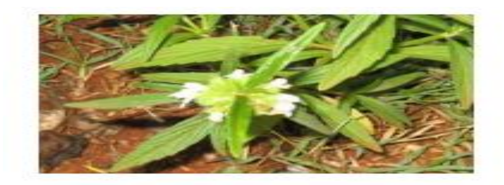
Figure: 4.1 Leucas aspera (Wild.) Linn

ISSN: 2320-3714 Volume: 3 Issue: 3 September 2021 Impact Factor: 5.7 Subject: Biotechnology