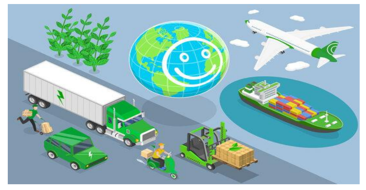
Figure-1 Green Maritime Suuply Chain Management: