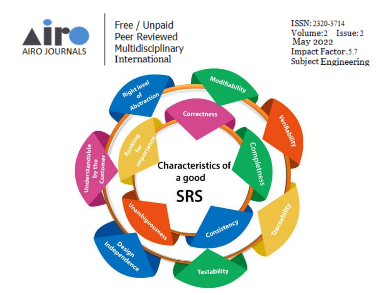
Figure: 1. Characteristics of good SRS.