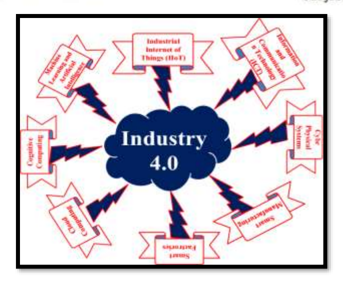
Figure 3: Technological challenges

ISSN: 2320-3714 Volume:3 Issue:3 September 2023 Impact Factor: 10.2 Subject: Computer Science