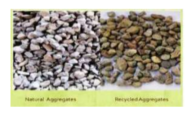
Figure 1.2 Natural and Recycled Aggregates

ISSN: 2320-3714 Volume: 1 Issue:3 March 2023 Impact Factor: 11.9 Subject: Civil Engineering