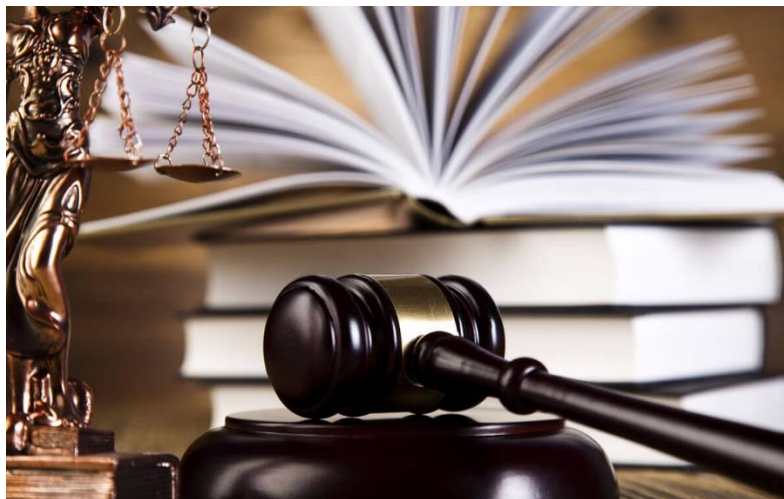
Figure 2: Administrative law.

It has greatly influenced the scope and application of administrative law. The interpretation of fundamental rights by the courts on the legal front has defined and shaped the basic rights set against the administration, as found clearly in the principles of natural justice: the right of being heard and the right to a fair hearing, setting a cornerstone under civil protection against arbitrary or unjust administrative measures.