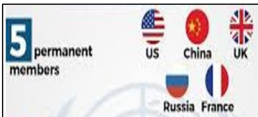
Figure 3: Permanent Member of UNSC

Permanent members: The five members of the Security Council who are designated as permanent members are able to veto any resolution that addresses substantive matters. This implies that a permanent member can veto the adoption of a resolution, but they cannot stop or end debate on such a resolution.