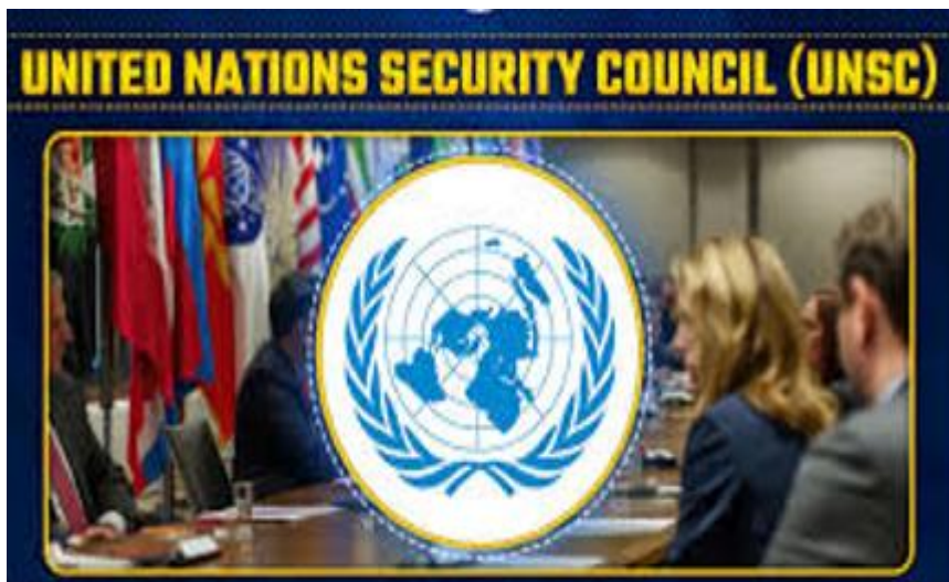
Figure 1: UNSC

The establishment of the UNSC in 1945 marked an important change in the balance of world power. The UNSC has ten elected, or non-permanent, members with rotating seats, but their impact is still quite small. The P5 maintains control over the other nations, frequently relegating them to a supporting position and limiting other UN members' capacity to significantly alter the structure and operations of the Council. The end effect is a system where the influence of more powerful governments reduces the voices of the majority. Due to the changing global political landscape of the twenty-first century, this significantly impairs the UNSC's capacity to address contemporary concerns. In order to create a more effective and responsive Council that can meet the current threats to global peace and security, the structural defect must be fixed.