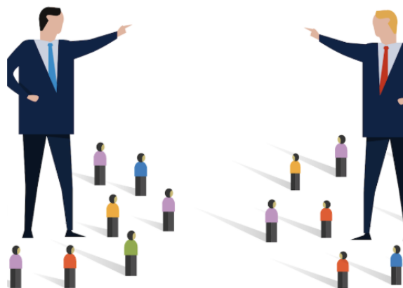
Figure 2: Political Polarization

Trends in political past have remarkably shifted due to historical, social, and technological advancements in India. always there was a difference in ideas, but polarization has increased in the last few decades with the sharp kind of political story, caste movement, religious bloc vote bank and media dominance.