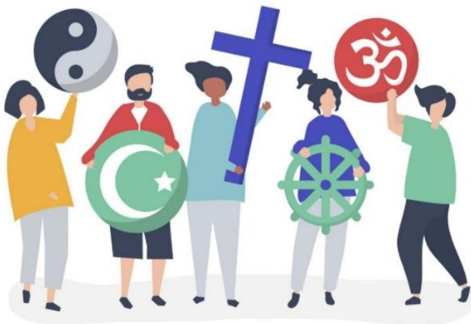
Figure 3: Religious and Identity-Based Politics

Religion, caste, and regionalism dominate Indian politics much of the time. Since Hindutva is the prevailing ideology, Sekularist-Hindutva conflict may have intensified. Ram Janmabhoomi, Babri Masjid, the Uniform Civil Code, and religious conversion have stressed society. Caste has divided individuals, and political parties use this technique to get votes. Reservation laws only aim to equalize persons' socioeconomic backgrounds, but they also incite hatred and divide society. Calls for decentralization or secession to recognize religious identity undermine national unity and integration.