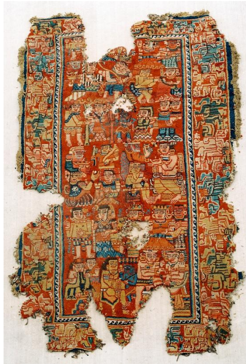
Figure 1: Khotanese Silk Fragment from the Silk Road

Islam as a religion developed in the 7th century CE, and spread very quickly into Central Asia, western China through conquest and trade. Muslim traders were the key engines in propagating Islamic doctrines, morals, and ways of life to new emerging places, as fellow religious people cohabited within the walls of a cosmopolitan marketplace.