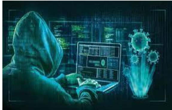
Figure 3: Cyber Threat

In order to obtain unauthorised access, steal sensitive data, disrupt operations, or create other undesirable effects, these threats might take use of vulnerabilities in computer systems, networks, or software.