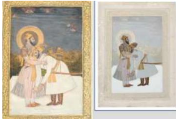
Figure 10: Simplification in the Foreground Area

Figure simplification for the foreground area. Figures, sections of figures, costumes, and objects are stylised. side and flat views. Demonstrate the traits of a parent who helps his son. A bent stance conveys deference and compliance.