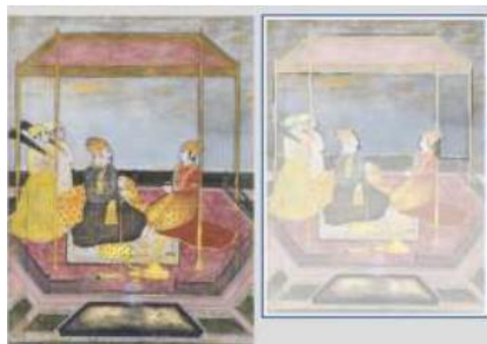
Figure 5: Nawab Aliwardhi Khan's Miniature Painting with a Visitor in Murshidabad, India

The artist uses light blue and a few yellow spots for backdrop space. The pseudo-cloud of flat colour.