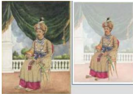
Figure 13: Cotton Clothing and Architectural Motifs in Islamic Culture

The position of the curtain is unclear for the centre ground area. The floor's colour is flat.