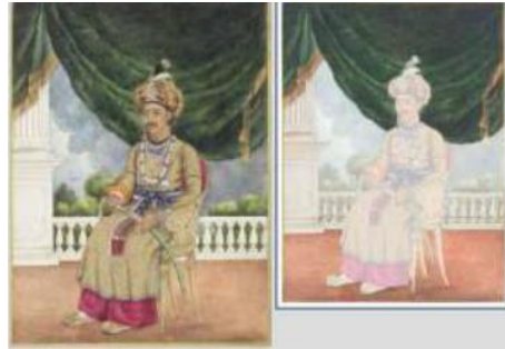
Figure 12: Unclear Curtain Position and Flat Floor Color in the Center Ground

The position of the curtain is unclear for the centre ground area. The floor's colour is flat.