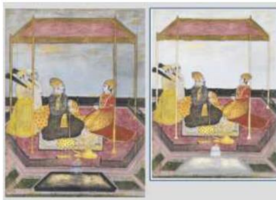
Figure 7: Nawab 'Aliwardi Khan of Bengal in a Garden Setting

For the centre ground: Nawab 'Aliwardi Khan of Bengal wearing a silver jama in a garden setting beneath a pink canopy. Mortals are held aloft by two attendants. The rigidly straight is a defining feature of the Murshidabad painting style. It was common practice to paint compositions beneath canopies. incomplete artwork, like the carpet. He supported the arts of the Mughals.