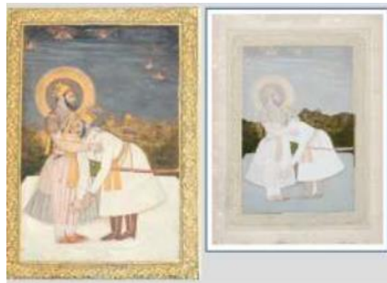
Figure 9: Background Space Elements in Mughal Art

For back ground space: Halo represent important and honorable man. Flat stroke for river and simplified water effect. Golden halo –shows the magnificent of the emperor. Simplification 6 putti adorning the scene in an unprecedented interpretation of emotions. The winged being was introduced by Jesuit missionaries in late 16th centuries.