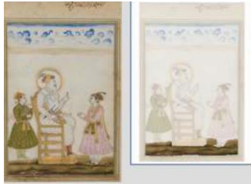
Figure 4: Limited Foreground Details and Abstract Appearance of the Building

a flower, while the other elements are arranged in a dynamic manner. begins to permit more realistic portrayal.