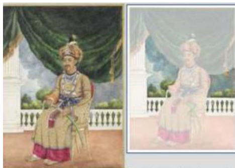
Figure 11: The Last Nawab Vizier of Oudh and the First King of Oudh

The last Nawab Vizier of Oudh (1814-1818) for background space. The East India Company's first King of Oudh (1818–27).