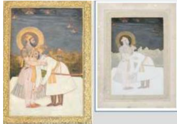
Figure 8: Shah Jahan Holding His Son Aurangzeb in Mughal India, Circa 1750

For back ground space: Halo represent important and honorable man. Flat stroke for river and simplified water effect. Golden halo –shows the magnificent of the emperor. Simplification 6 putti adorning the scene in an unprecedented interpretation of emotions. The winged being was introduced by Jesuit missionaries in late 16th centuries.