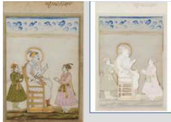
Figure 2: Shah Jahan Seated with Attendants in Early 17th-Century Mughal India

This study examined a wide variety of artworks, emphasizing how these pictures expressed dedication and represented the social and spiritual exchanges of the times. In order to convey the intricate link between faith and artistic expression in the Indo-Muslim milieu, Mumtaz examined the paintings’ methods, topics, and symbolism. Through examining a range of artists and their creations, the study shed light on the profound influence of devotional imagery on South Asian religious rituals and creative expression. The discoveries provided important new information on the relationship between art, religion, and identity, highlighting the paintings’ significance in comprehending the larger sociocultural dynamics of the time.