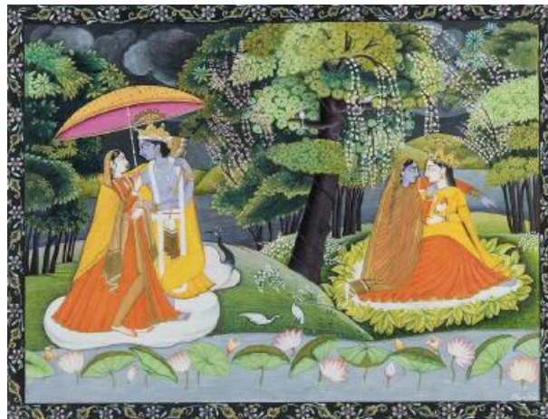
Figure 1: Dhani Ram, Radha Krishna in the Rain, natural pigments on paper, 8.25 x 11 inches

writes: "The first Indian miniature paintings can be dated back to 7th century AD that are dated back to Palas of Bengal. During their rule, Buddhist text and scripts were painted onto the manuscripts of 3 inches broad palm leaves depicting pictures of Buddhist gods and goddesses. Pala painting has smooth colors and running lines; it resembles paintings inside the Ajanta walls. Later on, there were different styles of their own: Rajasthani, Pahari, and Mughal schools, which depicted nature, flora, fauna, and urban life differently. Miniature paintings were used for the celebration of nature as well as eco-friendly techniques. Courty life, love scenes, and daily activities were the most common themes, but nature always existed. Artists painted detailed landscapes, architectural elements, and abundance of flora and fauna.