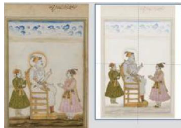
Figure 3: Strict and Formal Style Example in Mughal Art

This study examined a wide variety of artworks, emphasizing how these pictures expressed dedication and represented the social and spiritual exchanges of the times. In order to convey the intricate link between faith and artistic expression in the Indo-Muslim milieu, Mumtaz examined the paintings’ methods, topics, and symbolism. Through examining a range of artists and their creations, the study shed light on the profound influence of devotional imagery on South Asian religious rituals and creative expression. The discoveries provided important new information on the relationship between art, religion, and identity, highlighting the paintings’ significance in comprehending the larger sociocultural dynamics of the time.