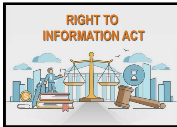
Figure 1: Right to Information Act as a Tool for Transparency and Accountability in India

The Right to Information Act, 2005 was one of the most important reforms in governance promoting transparency and accountability. The Act gave citizens the right to request information from public authorities, and led to increased public scrutiny of government decisions and administrative actions. It was important in reducing secrecy in administration and in raising democratic accountability.